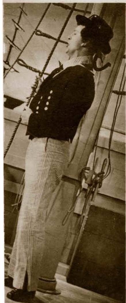
seen again on Tuesday and Thursday.

This film shows a very unusual form of angling—swordfishing. The sport is thrilling and sometimes dangerous; the rod is often strapped to the angler's body. Much spectacular work has to be done before the fisherman can fly the flag that denotes a catch.