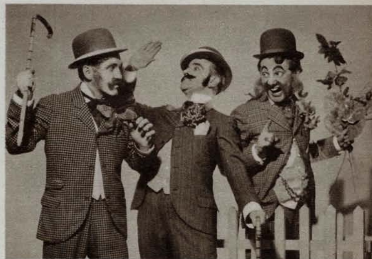
THE MUSIC-HALL BOYS who will be seen by viewers on Friday in a burlesque programme of the 'nineties at 9.0

This act consists of three male artists who specialise in a burlesque of ballad singing in the 'nineties, and who wear costume and moustaches reputed to be more or less appropriate to the period. Their efforts at historical reconstruction have been appreciated both in America and in England.