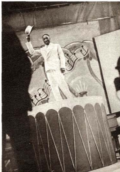
This drum will never go into the television studio again. The first paragraph on this page gives you the reason.