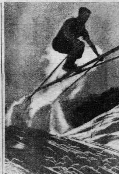
On Saturday at 3.25 and 9.25 viewers will see a winter sports demonstration, illustrated by mannequins and films

Val Rosing, vocalist to Henry Hall until 1932, has been a great success in vaudeville and musical shows, and will be seen shortly in an English film entitled Feather Your Nest . The band he is to bring to the studio today will consist of a guitar, bass, piano, trumpet, and saxophone—and of course Val Rosing will supply the vocal accompaniment.